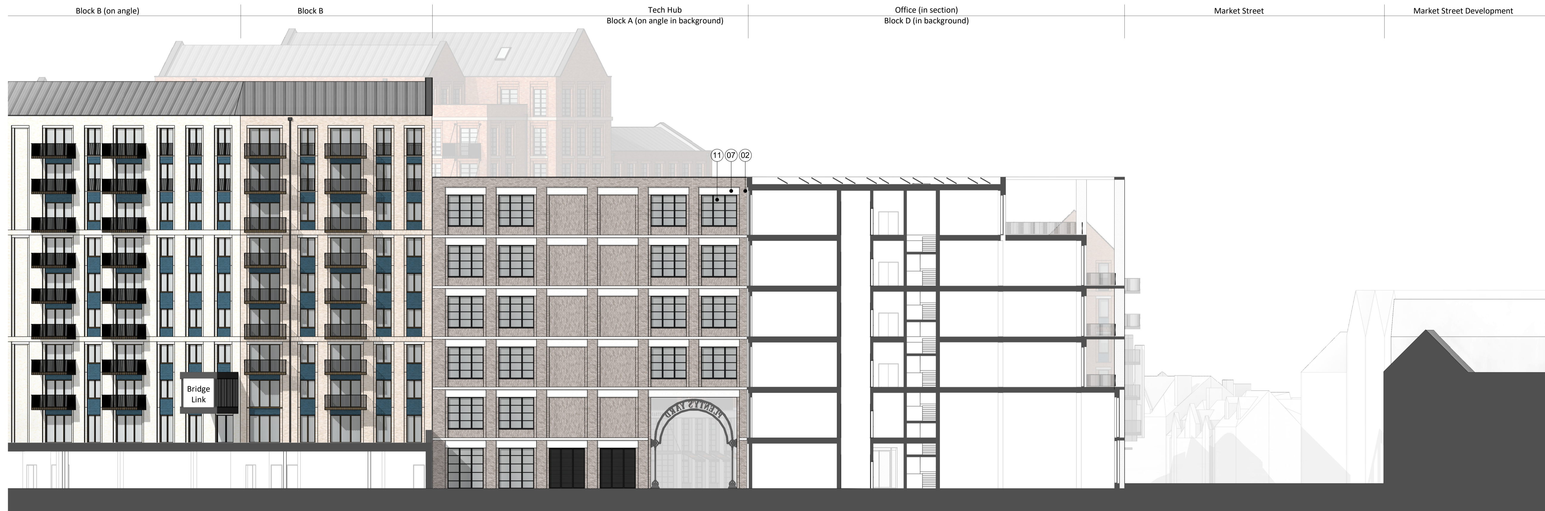
4 Office - West Elevation 1 : 200