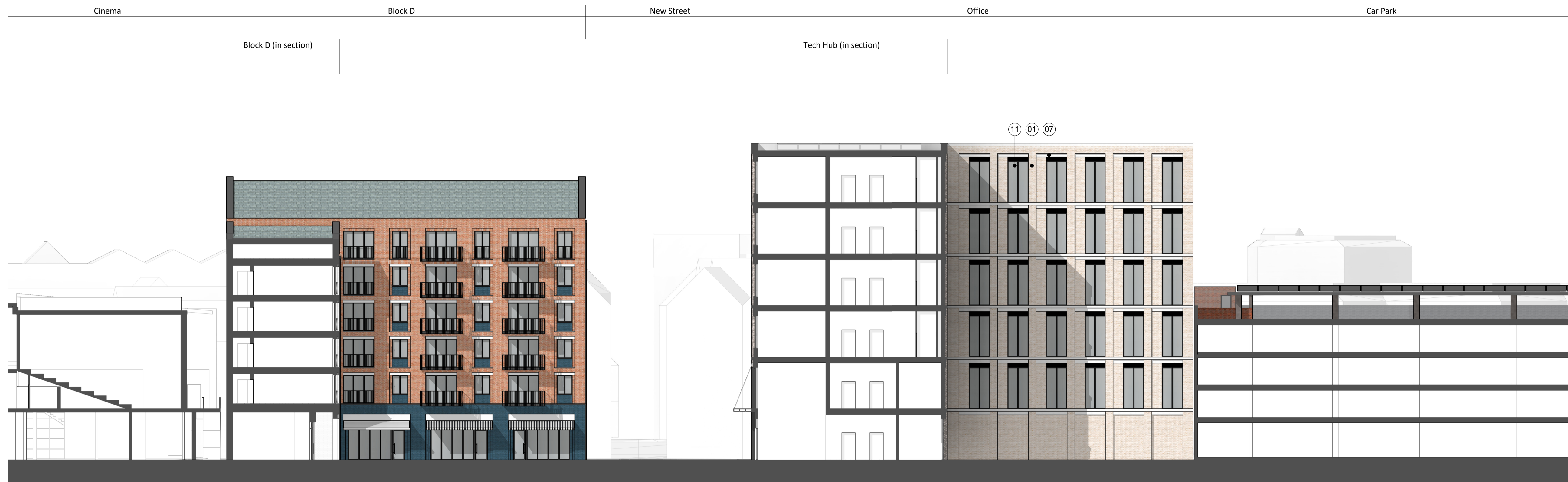
3 Office - North Elevation 1 : 200