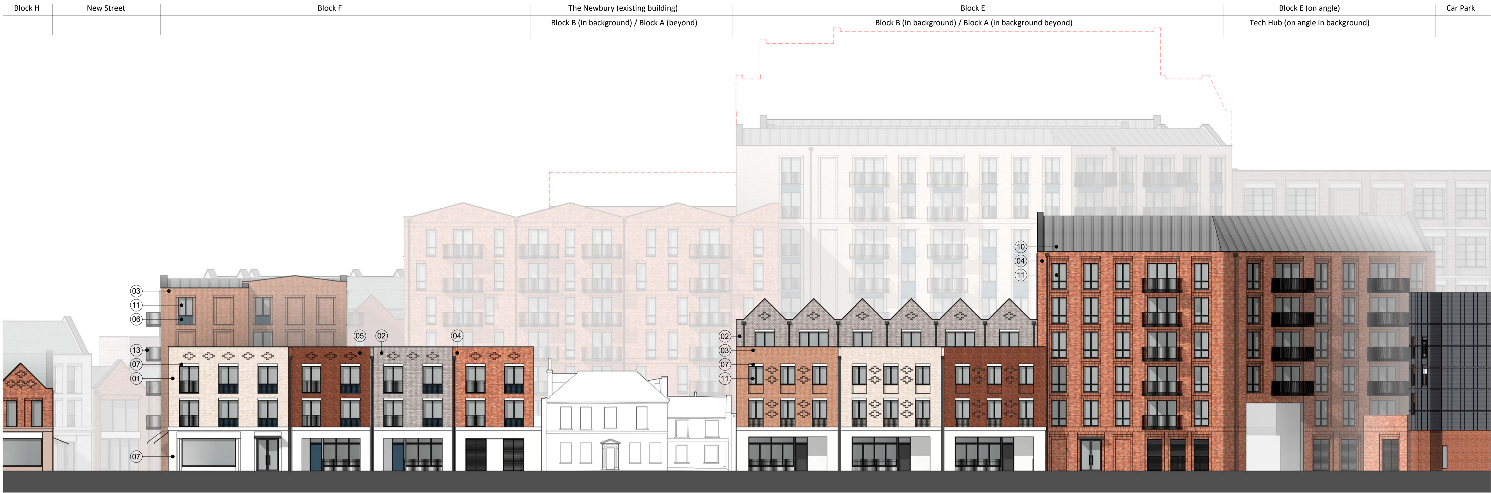
1 Block E & F - West Elevation