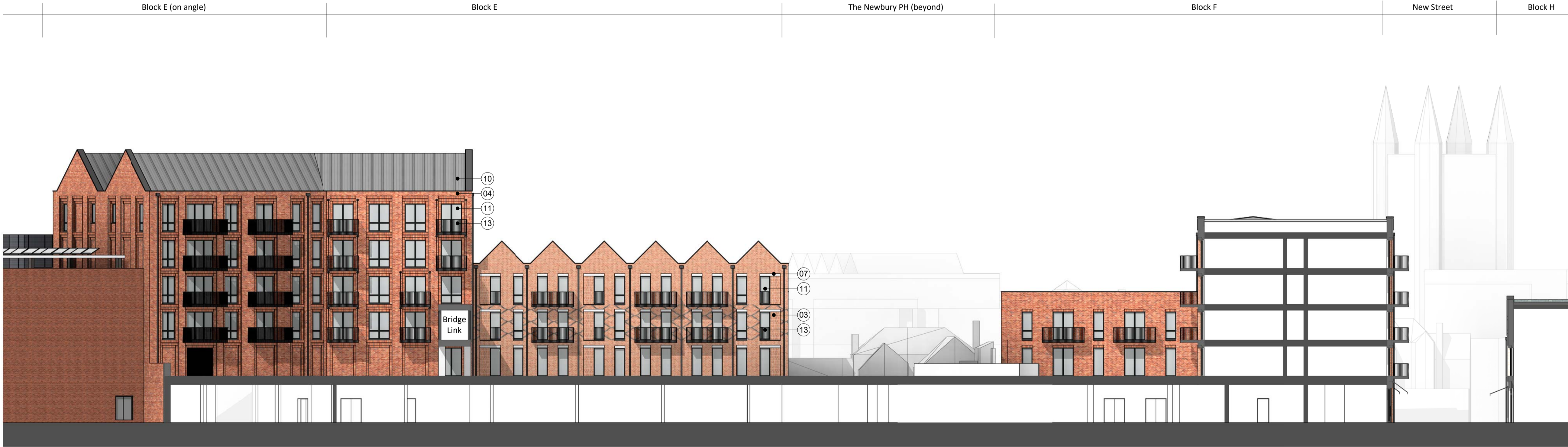
2 Block E & F - East Elevation